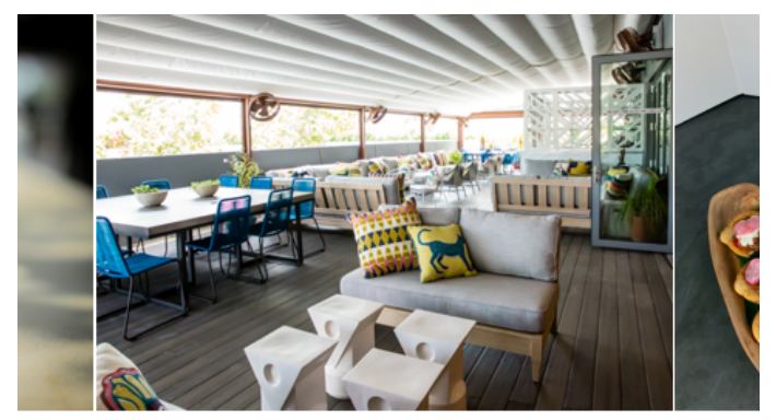
(<a href="http://www.midtownmiamimagazine.com">http://www.midtownmiamimagazine.com</a> miami-magazine-music/no-3-rocksartwalk-with-local-musicians/)

No. 3 Rocks Artwalk with Local Musicians (http://www.midtownmiamimagazine.com/midtownmiami-magazine-music/no-3-rocks-artwalkwith-local-musicians/)