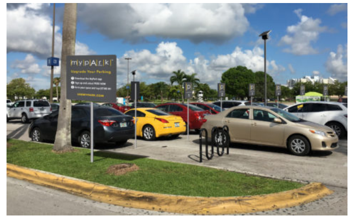
(<a href="http://www.midtownmiamimagazine.com">http://www.midtownmiamimagazine.com</a> miami-magazine-tech/mypark-secures-2-1-million/)

(http://www.midtownmiamimagazine.com/arts/steplshames-opens-cycling-studio-geared-towards-body-positivity/)