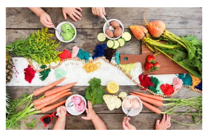
(<a href="http://www.midtownmiamimagazine.com">http://www.midtownmiamimagazine.com</a> miami-magazine-eat/13545/)